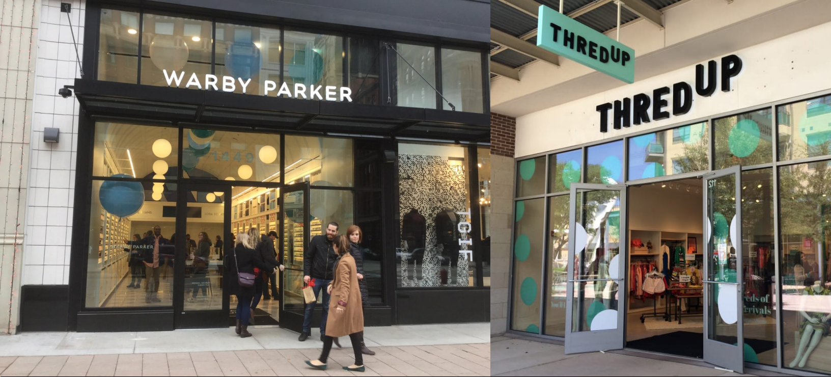
▲ PREVIOUSLY ONLINE-ONLY RETAILERS WARBY PARKER AND THREDUP HAVE OPENED UP BRICK AND MORTAR SHOPS ACROSS THE COUNTRY.

or not you use their store credit card. Within the last 18 months, Kohl's stock has risen from $35 per share to over $65 per share! Nordstrom also offers benefits with or without their store credit card as long as you are signed up for their revamped loyalty program: The Nordy Club . If you buy name brand cosmetics, most of you know they are usually the same price at any department store. Now at Nordstrom , these cosmetics will be shipped to you free of charge and you will also earn points. All this without stepping foot in the store and being tempted along the aisles to purchase other items! Free shipping by retailers has become an important part of the consumer decision on where to shop.